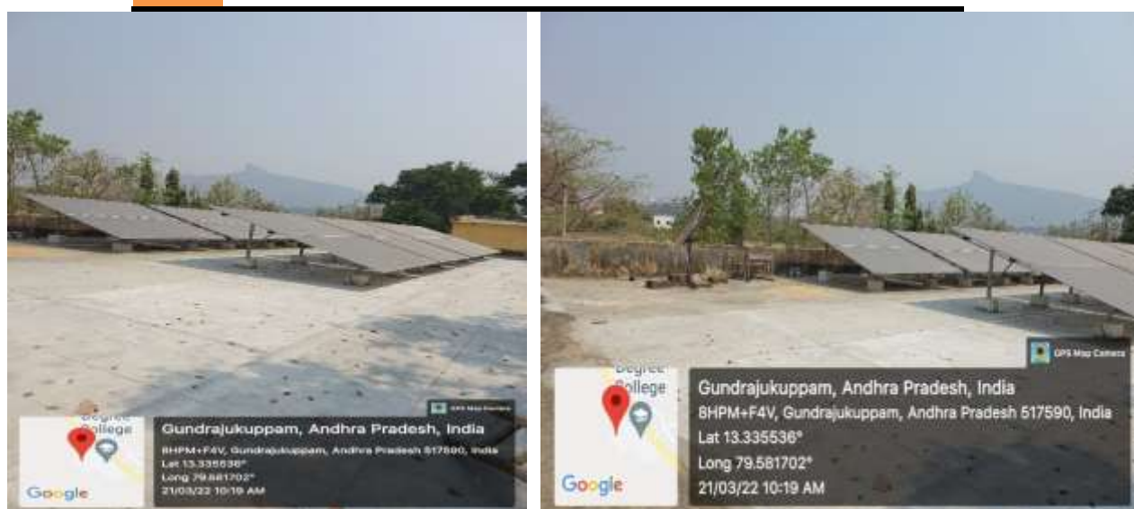
Solar panels fixed on the top floor of the college